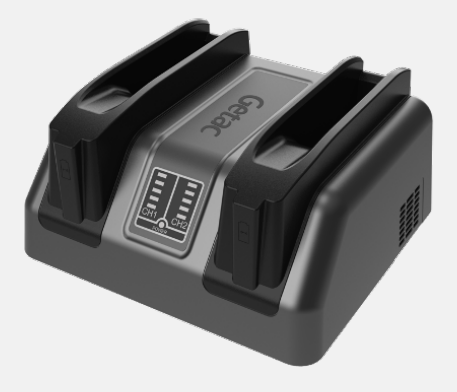
Two Main Batteries