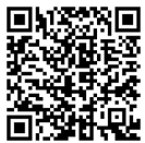
X500server 3D demo