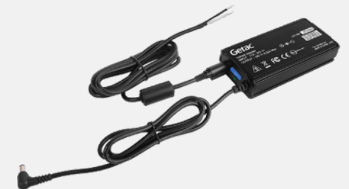
Bare Wire Version