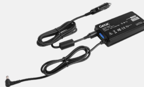
Cigarette Lighter Plug Version