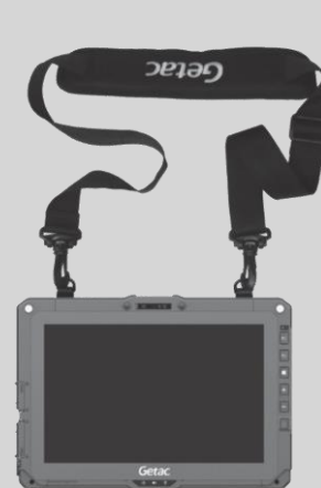
Attaching to the Tablet