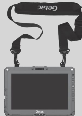
Attaching to the Tablet