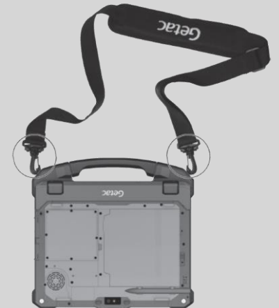
Attaching to the Detachable Keyboard