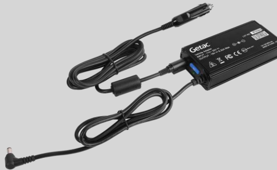
Cigarette Lighter Plug Version