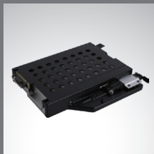
Multimedia bay 2 nd storage