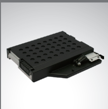
Multimedia bay 2 nd battery