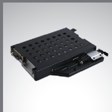
Multimedia bay 2 nd storage