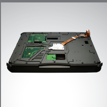
PCI/PCI-Express 3.0 expansion unit