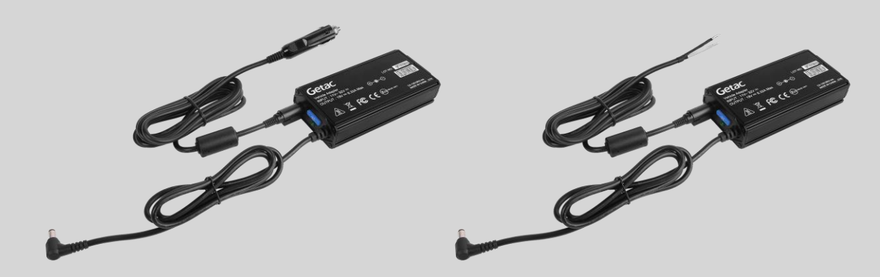
Cigarette Lighter Plug Version

(Cigarette Lighter Plug Version) GAD2X8 (Bare Wire Version)