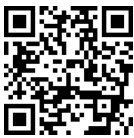
S510 3D demo