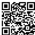
K120 3D demo