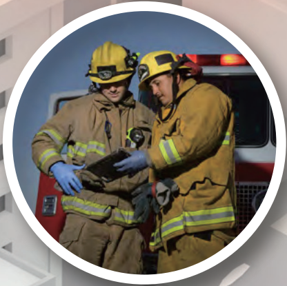
GETAC F110 3D EXPERIENCE

Turn any emergency vehicle into a command centre with Getac Solutions. Our rugged laptops and tablets offer fast and powerful wireless connectivity technology to ensure critical incident information is available in real time.available in real time.