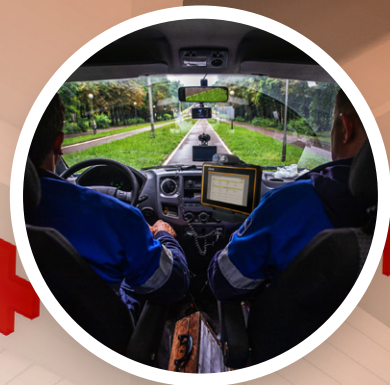
Getac UX10-IP 3D Experience