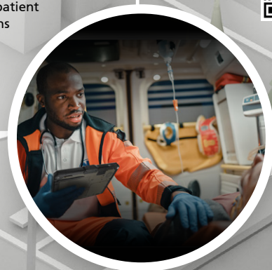
Getac F110 3D Experience